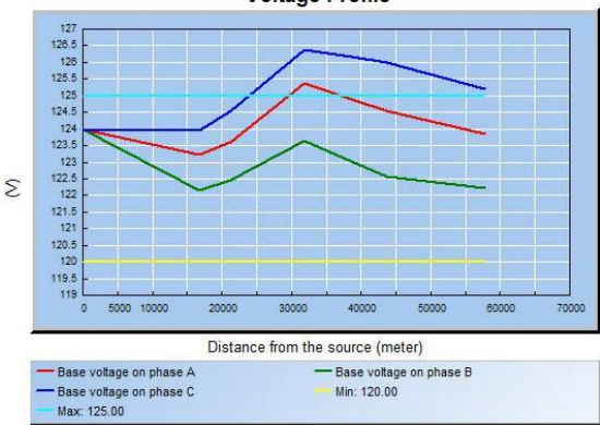
Fig. 2. Exchange of phase voltage transformer Smart system

Figure 3 shows instantaneous load information distribution network.